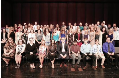
^ Crown Point High School scholarship winners at 2018 Awards Night.