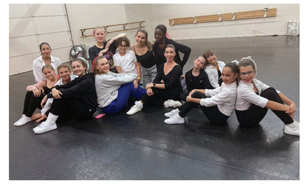
INDIANA BALLET THEATRE STUDENTS ENJOY THE NEW FLOOR.