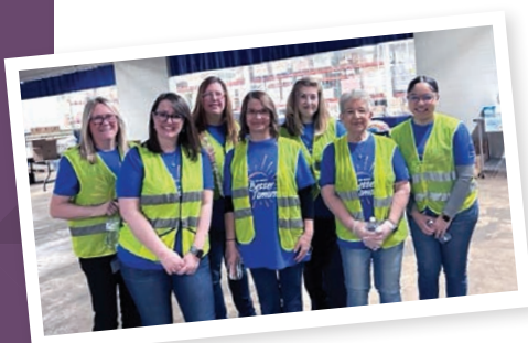
FOODBANK OF NWI: Centier Bank Associates volunteered at the NWI Foodbank to help pack boxes for those in need.

MISSION: Indiana's largest private, family-owned bank is a testament to the idea that no matter how large a business grows, it is still possible to provide remarkable service. This comes naturally to Centier associates because of our servant heart culture. We have come to be known for warm, personalized service and relationship-style banking. Centier Bank's commitment to community means neighbors are serving neighbors, working together to create a better way of life today and for future generations.