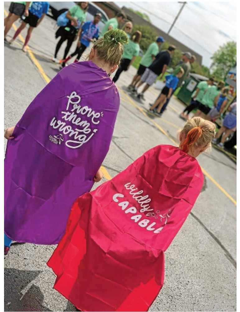
Girls on the Run in Northwest Indiana serves 10 counties and about 2,000 girls a year.