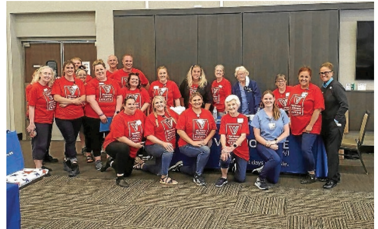
VNA Hospice volunteers are involved with everything from palliative care to Meals On Wheels in Porter County.

not been easy during COVID, so we are excited about this opportunity the Crown Point Community Foundation is offering to local nonprofits. We are grateful for the support they provide to local organizations, and how they are willing to work to connect us with volunteers. We hope that people who are interested in helping us