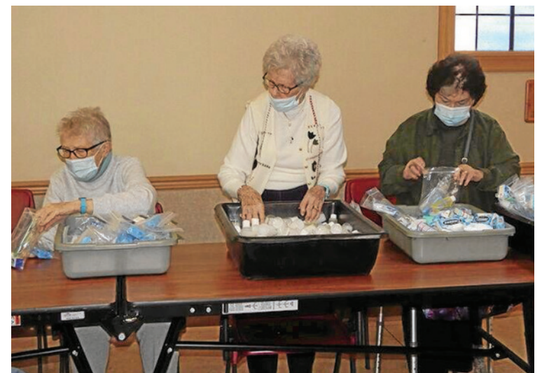
Community Help Network volunteers pack personal care items for those in need.

Top: The Alzheimer's Association helps those with dementia while making efforts to find a solution to the disease. Below: Girls on the Run of Northwest Indiana is looking for coaches, assistants and others to help empower girls.