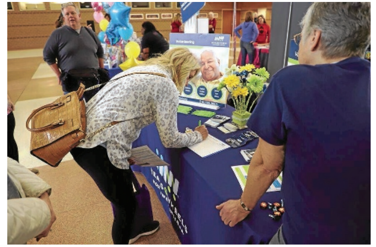
Meals on Wheels of Northwest Indiana seeks help with delivery as well as packing meals.