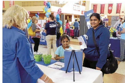
The Fair helps match prospective volunteers with organizations in need.

According to the U.S. Department of Agriculture (USDA), 726,020 people including 225,750 children in Indiana lack adequate amounts of food. Food insecurity