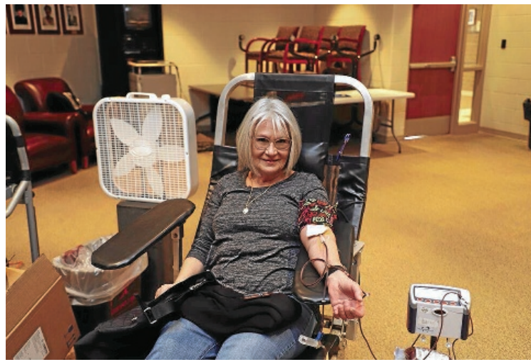
Versiti Blood Centers is on hand to replenish supplies diminished during the holidays.