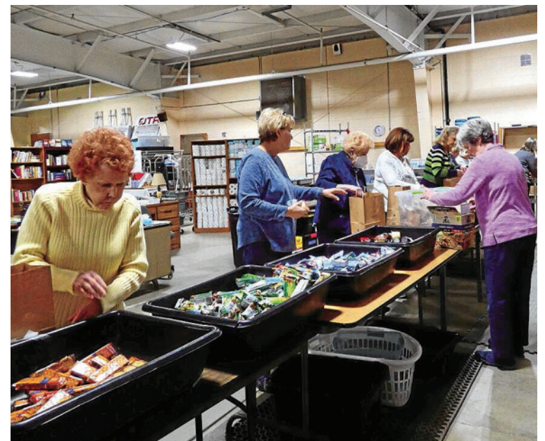
Community Help Network operates a Buddy Bags program and Household Pantry.