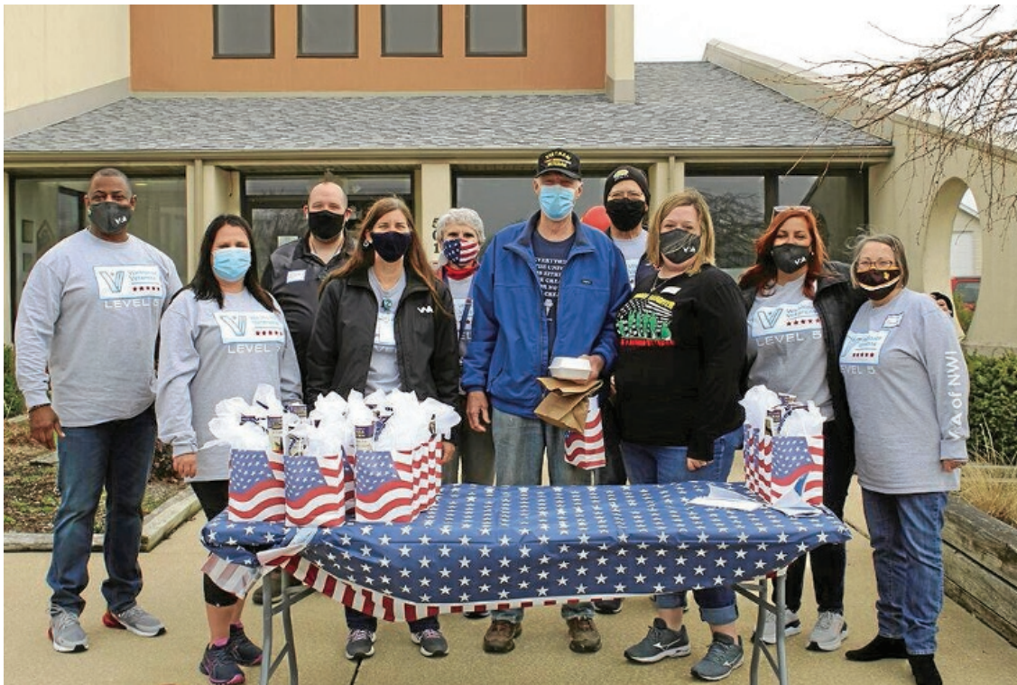
VNA Hospice of Northwest Indiana recruits veterans to work with patients.