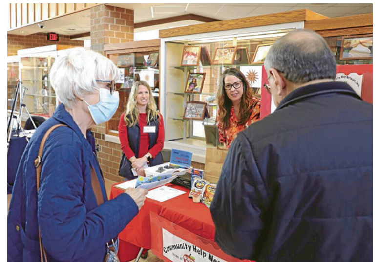
The Community Care Network strives to assist children and families who are food insecure.