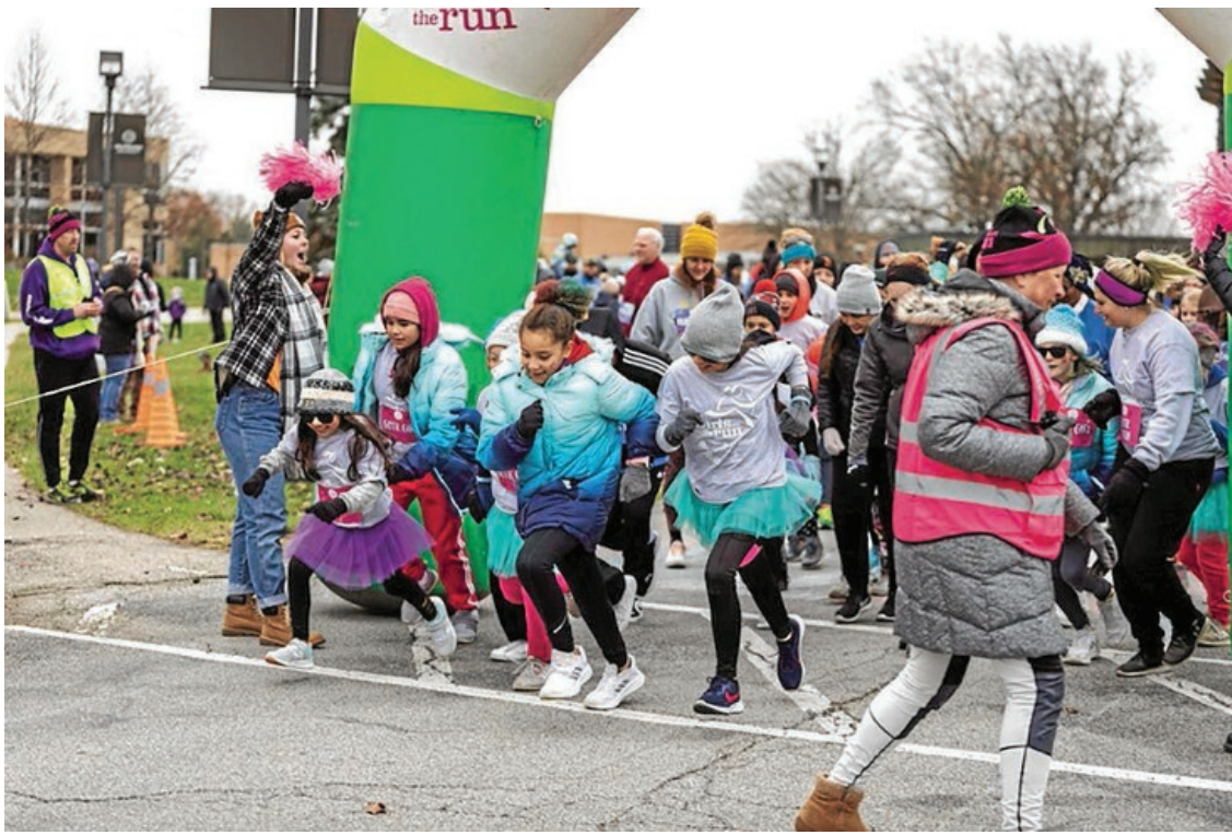
Girls on the Run builds healthy physical and emotional habits.