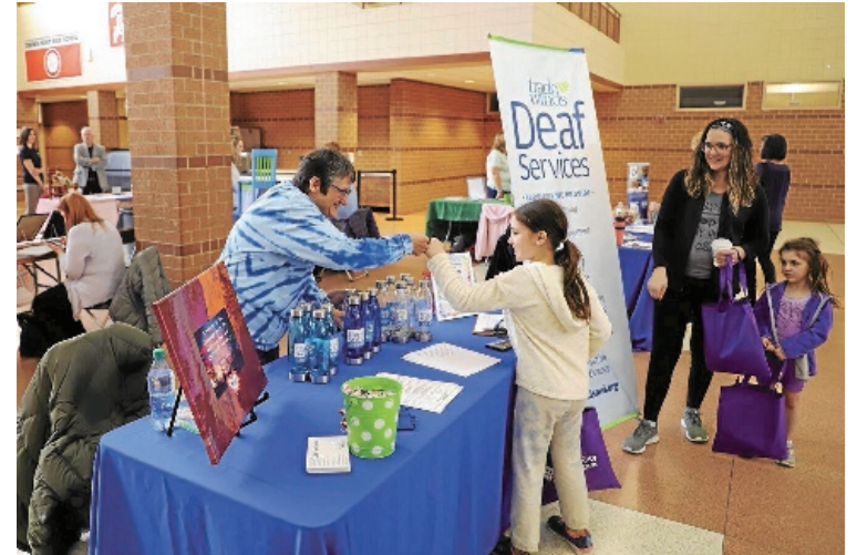
TradeWinds Deaf Services is among the nonprofits at the Fair.